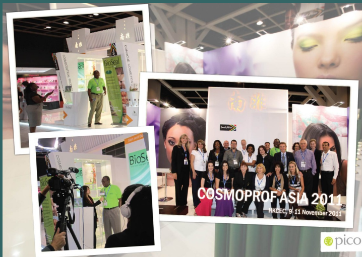
Exhibition of Cosmeceutical in Hong Kong