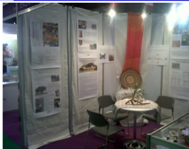
Everpix: Exhibition stand at In-Cosmetic conference, Asia

There was substantial interest in the African oils. The people liked the marula oil particularly due to the fact it lacks a smell, which is due to the stabilization process and also because of its emollient properties, a heavy oil with a light touch" explained, Dr Goyvaerts.